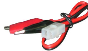
Alligator clip connector adapter