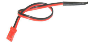
70C Temperature sensor