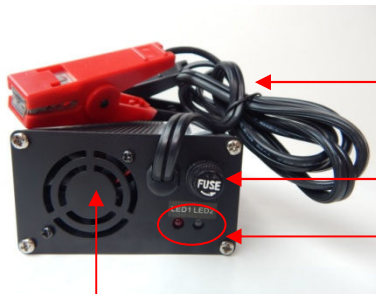
Output alligator clips