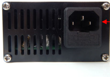
Power Cord Adaptor